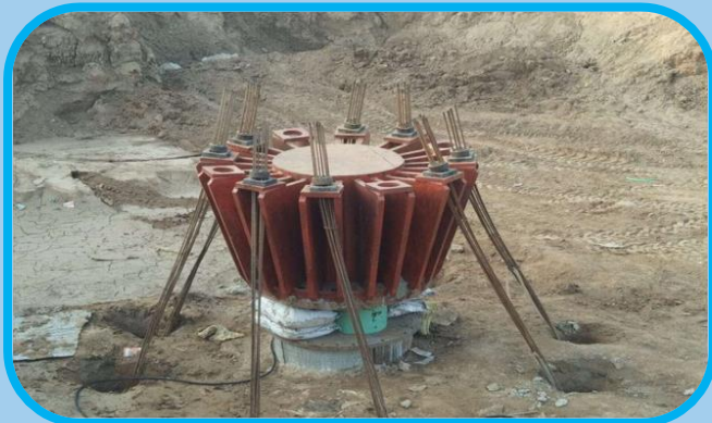
PILE LOAD TEST-ANCHOR