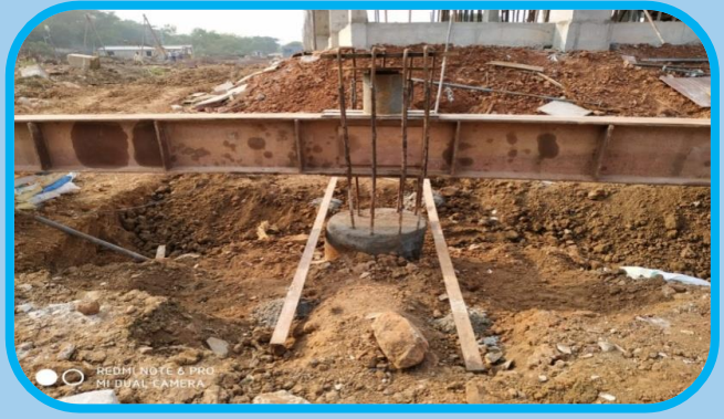
PULL OUT TEST