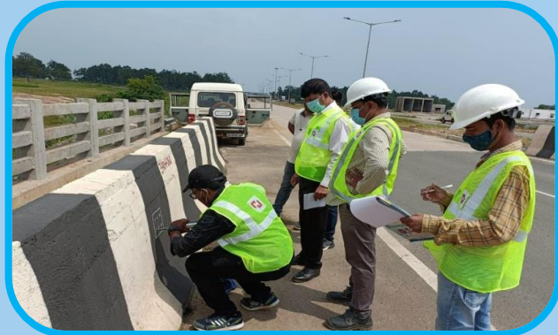
REBOUND HAMMER TEST