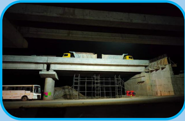
BRIDGE LOAD TEST