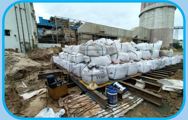
VERTICAL LOAD TEST