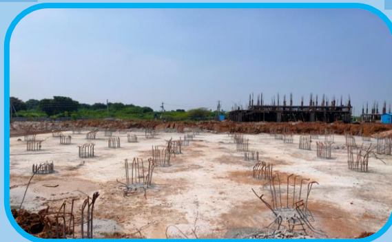
PILE INTEGRITY TEST